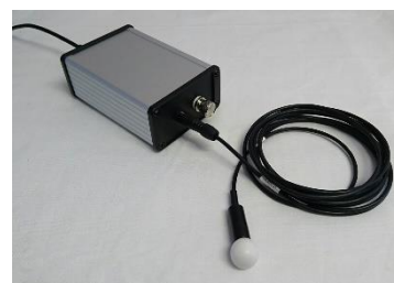
Single Spherical PAR sensor with interface box.

A single sensor option is also available, operated via PC with a USB link.